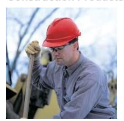
Safety and Construction Products